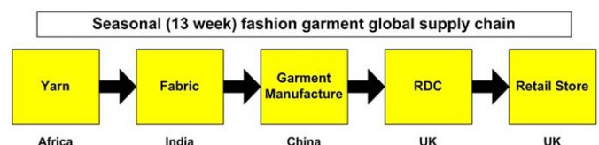
Fig. 3. Typical fashion garment global supply chain.

It is recognised that SCM initiatives such as integration and rationalisation of the supply chain can result in increased responsiveness and reduced supply chain costs (Holweg et al., 2005; Frohlich and Westbrook, 2001). In particular, supply chain integration and supply base rationalisation are directly linked to CSR. Supply chain integration and the requisite development of closer trading relationships reduce the need for excessive monitoring of activities and can thus reduce the cost of CSR implementation (Vachon and Klassen, 2006). Rationalisation of the supply chain by removing unnecessary tiers of suppliers can increase visibility and enable better management of CSR initiatives. This is especially important in complex global fashion apparel supply chains where visibility beyond the first or second tier suppliers is poor (Welford and Frost, 2006). Fig. 3 shows a typical seasonal fashion garment global supply chain spanning several continents and using Far East manufacturing to take advantage of lower labour costs.