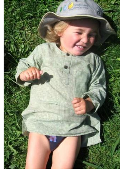
BOY'S SUN SHIRT