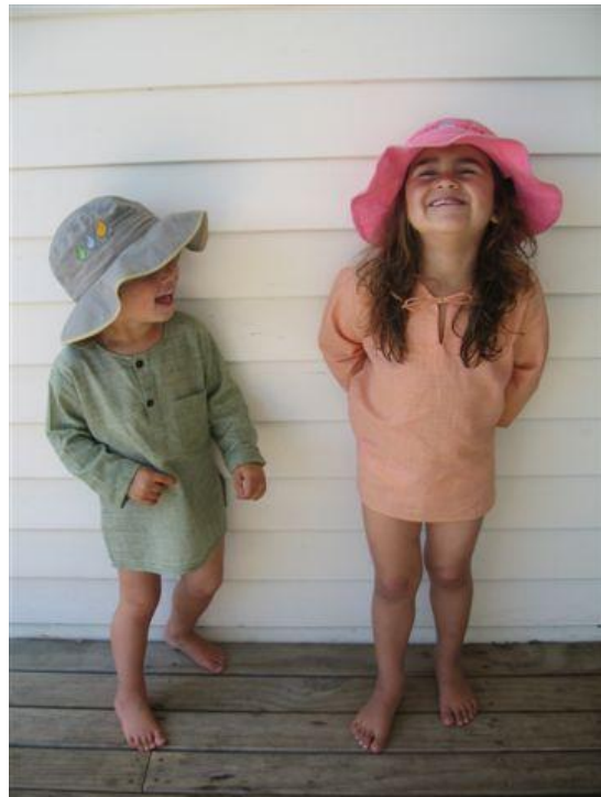
SUN SHIRT AND KAFTAN

They are lovely on beach as a protection against the sun and easy to carry at home as a casual wear.